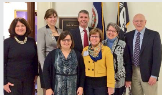
VSBA members meet with Representative Rob Wittman (VA-01).

Thank you to all of those board members who participated in the 2015 Advocacy Institute and Day on the Hill. VSBA looks forward to continuing to work with all of our board members and members of Congress to ensure a robust public education system for the Commonwealth.